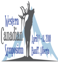
WESTERN CANADIAN SYMPOSIUM